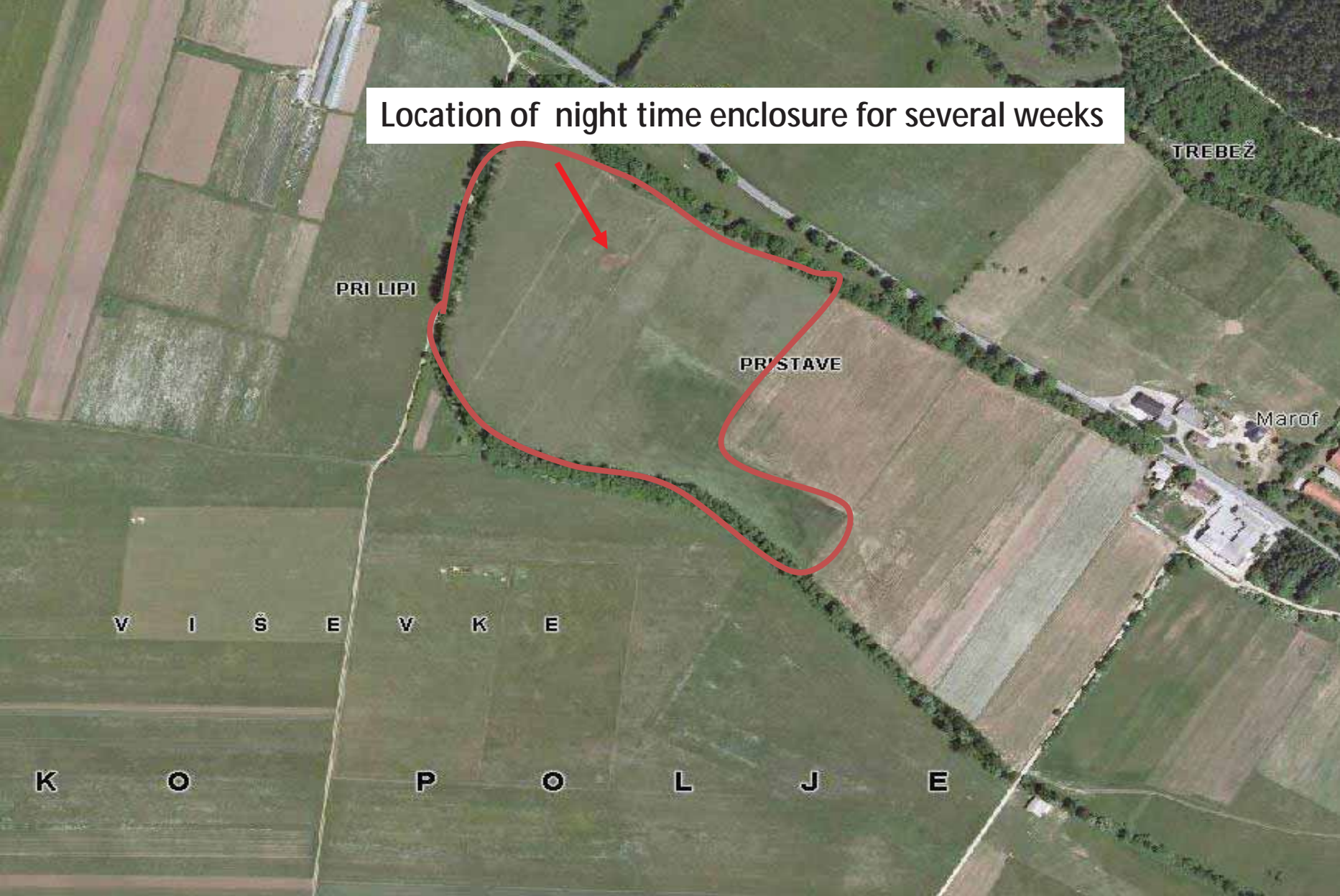
An ariel photo of pasture (blue line) and night time enclosure, Cerknica, 2009