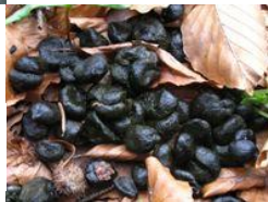
Figure 3 (right): Roe deer feces (faecal pellet group).

modelling. Field work for the estimation of prey densities with faecal pellet group count method has started in April 2010. At that time we set up the sampling plots in three research areas and cleaned them of all faecal pellets. In June and August we visited the plots and counted all accumulated pellet