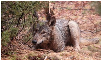
Figure 7: Male wolf, named Brin, was captured on 13.4.2010.

Point 4 (Surveillance of individual wolves using GPS-GSM telemetry): One male wolf (Figure 7) has been equipped with a GPS-GSM radio collar. Up to date of 31/08/2010 we got 1048 GPS locations. Maps showing spatial use and home range were prepared and used as educational and promotional material published on the project internet page (e.g. http://www.volkovi.si/en/blog/92-gibanje-tropa-slavnik-v-avgustu ) and Wolf Monitoring Portal. Four wild prey remains have been found as a direct result of near-real-time GPS surveillance data in the field.