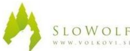
Figure 8: Project logo.

The aim of this action is to run a targeted public awareness and education campaign based on knowledge-gap analysis provided by the attitude and knowledge survey. Work has started and is continuing as planned. At the beginning of the project we focused on development of an attractive project graphic design (Figure 8). Targeted public awareness campaign will start after we will get the results from Action A.6 – Public attitudes (after 01/07/2011). In the first year the public awareness campaign is focused on promotion of the project, LIFE+ program, and involving volunteers in activities of Actions C.