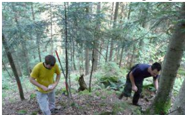
Figure 2 (up): Cleaning of fecal pellet groups in a sampling plot.

An assessment of the natural prey base for wolves in Slovenia will be done through combination of hunting bag analyses, field work (pellet group counts) and GIS