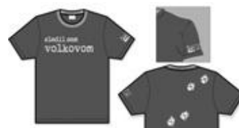
Figure 9: Graphic design of the project T-shirt for volunteers.

In the period of inception report 4 articles have been prepared for national and local written media and several television and radio interviews have been made (Annex 7.5.6 – List of media work). In this way a lot of positive attention has been drawn to wolves and the wolf conservation project in the media. First video shots in the field have been made for the project documentary and graphic design for the project T-shirt for volunteers has been prepared (Figure 9). After releasing the project web-page (Action D.4) we have prepared a press release and send it to around 50 media contacts. Articles were mostly published on the internet (Annex 7.5.7 – List of media articles on the Internet). The action is continuing as planned and all deliverables will be finished up to dates planned in the project. Next planned activity is print and dissemination of project T-shirts and preparation of the first number of the project bulletin.