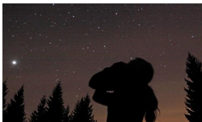
Figure 5: Volunteer during field-work – monitoring with wolf howling on Racna gora in August 2010

Goal of this action is to establish a complex, science based surveillance of wolf population conservation status based on gathered data and results integrated that are publicly accessible through an Internet-based Wolf Monitoring Portal. Work has started earlier because the work for preparatory action (A1) has been partly overlapping with the work on this action.