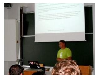
Figure1: Presentation of protocols and goals of the wolf monitoring with howling for volunteers at UL on 25 th August 2010.